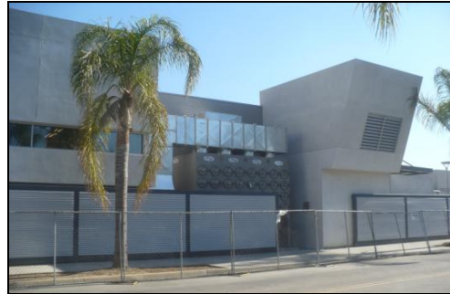
Industrial Technology Center at PCC