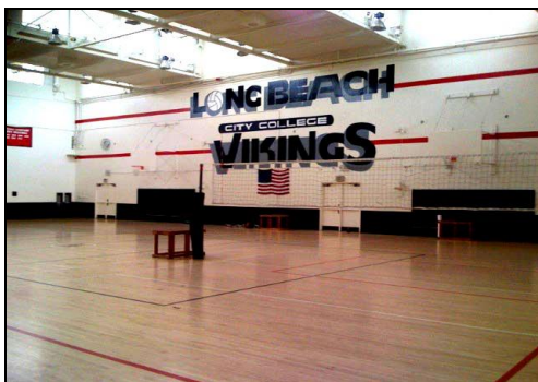
Small Gym Renovations at LAC