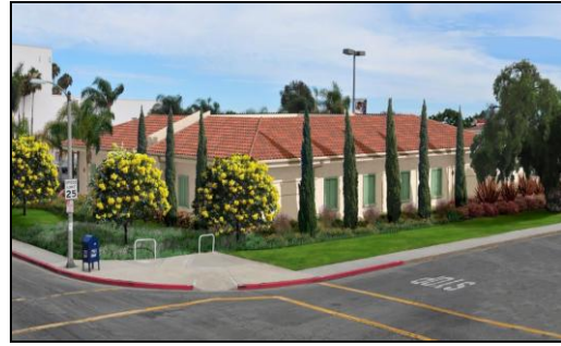
Building I Bookstore Retrofit at LAC