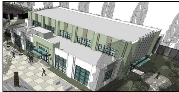
Building CC Retrofit at PCC