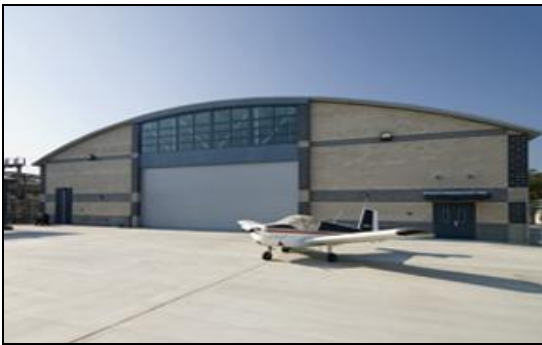
Automotive and Aviation Complex (Tech 2) at PCC

Automotive and Aviation Complex (Tech 2) at PCC Boiler Replacements at LAC Building UU/VV Demolition at PCC Building Z Retrofit at LAC Central Plant at LAC Central Plant at PCC Child Development Center at PCC District Facilities and Warehouse Complex at LAC Industrial Technology Center at PCC Infrastructure Improvements at PCC Language Arts Building Renovation at LAC Large Gym Façade and Renovations at LAC Learning Resource Center at LAC Learning Resource Center at PCC Small Gym Renovations at LAC South Quad Complex at LAC