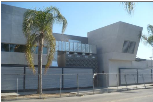
Central Plant at PCC