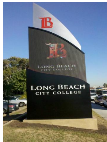
Electronic Marquee at PCC