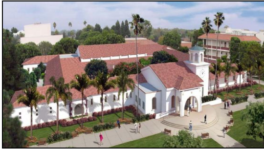
Building A Student Services Retrofit at LAC