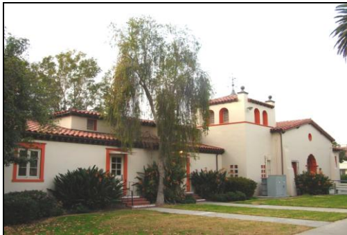
Language Arts Building Renovation at LAC