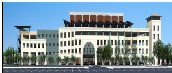
Parking Structure in Lot J at LAC