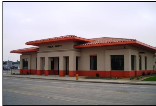
Central Plant at LAC