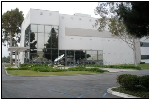
Building O at LAC (front building)