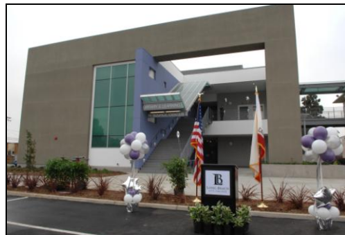
Learning Resource Center at PCC