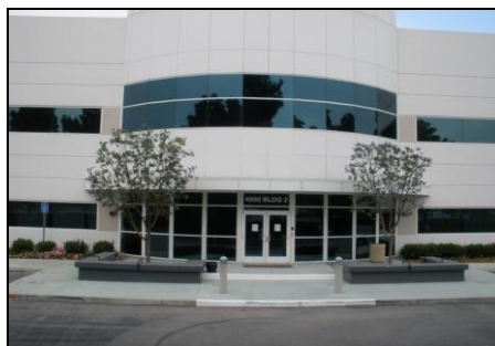
Building O at LAC (back building)