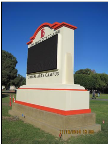
Electronic Marquee at LAC