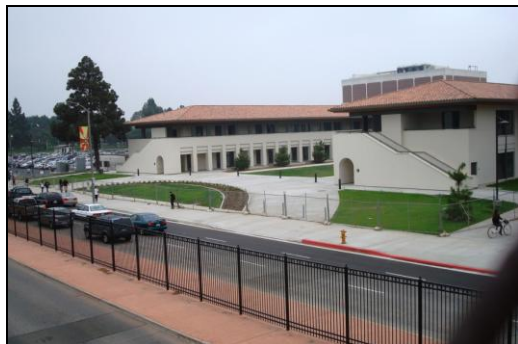
South Quad Complex at LAC