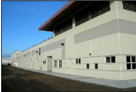
District Facilities & Warehouse at LAC