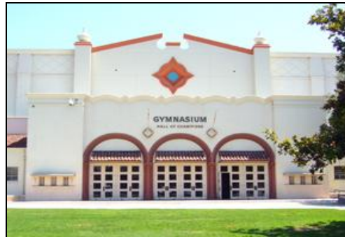
Large Gym Façade Renovations at LAC