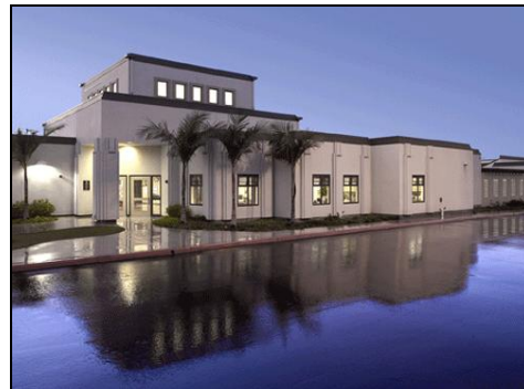
Child Development Center at PCC