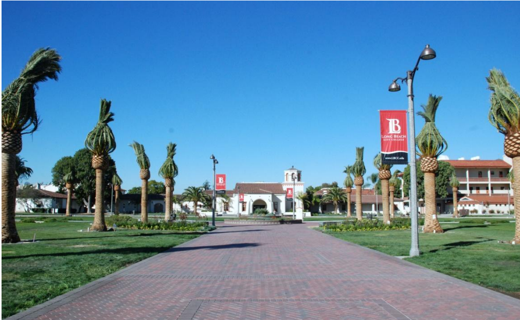
BUILDING A STUDENT SERVICES RETROFIT AT LAC