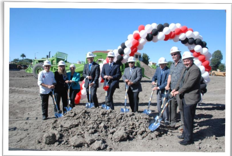
Building V Groundbreaking Ceremony – September 24, 2013