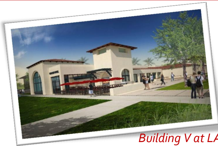
Building V at LAC

Construction on our new Math Tech building began in September 2013. The design of the building won the CCFC 2012 Design Award of Merit. The Math Department, Culinary Arts and Reprographics will call the new building home in Winter 2015.