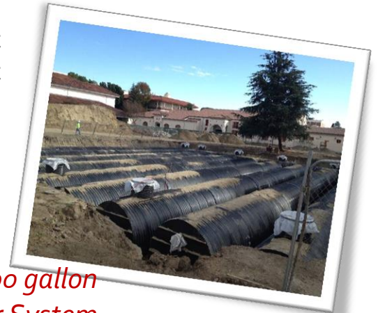
LAC Central Quad - 365,000 gallon Active Storm Water System

Several large projects have kept the Facilities Department and the Bond Management Team busy during 2013. The construction projects that are currently underway are highlighted on this page.