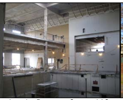
Learning Resources Center - LAC