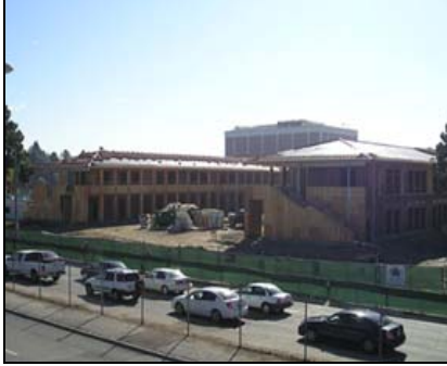
South Quad - LAC