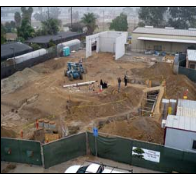
Central Plant - PCC