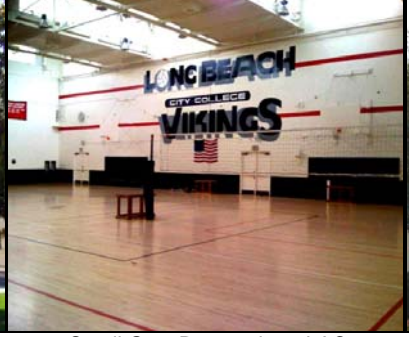
Small Gym Renovation - LAC