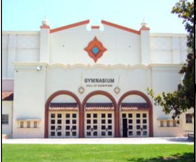
Large Gym Façade – LAC