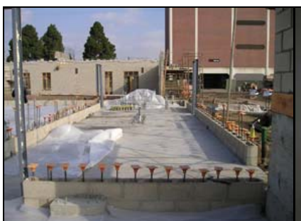
Central Plant - LAC