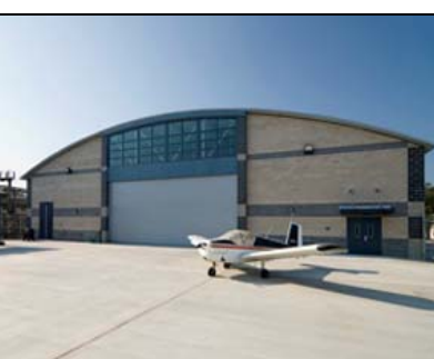
Tech II - PCC