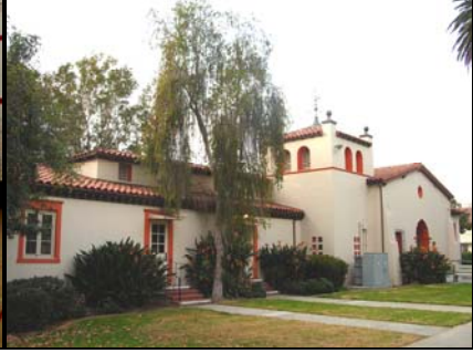
Language Arts Bldg. Renovation – LAC