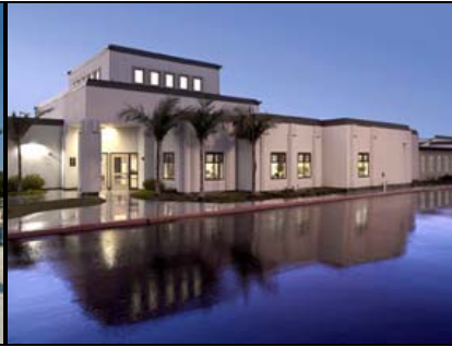
Child Development Center - PCC