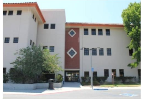
LAC Building D

The second floor of Building D saw improvements in 2012. Soon the 1 st and 3 rd floors will be painted and modernized.