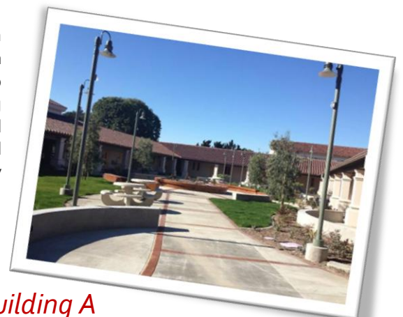
The courtyard inside LAC Building A

Phase 2 of our MDAB project began in December 2012. All occupants from Buildings AA and BB have moved into temporary space. The new building will house new classrooms equipped with modern technology. Anticipated completion of Phase 2 will be early 2015.