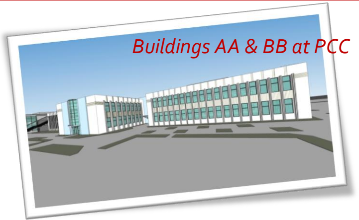
Buildings AA & BB at PCC

The Facilities Department and the Bond Management Team have been working on several projects during 2012. Here is the current status of the construction projects underway.