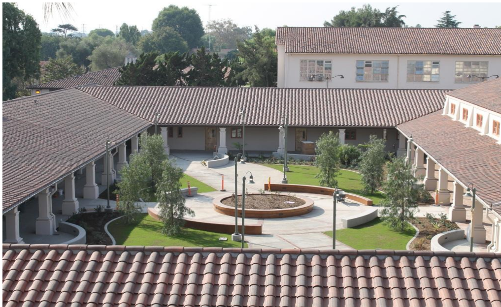
BUILDING A STUDENT SERVICES RETROFIT AT LAC