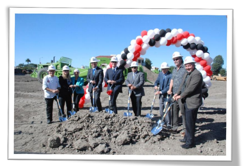
Building V Groundbreaking Ceremony – September 24, 2013