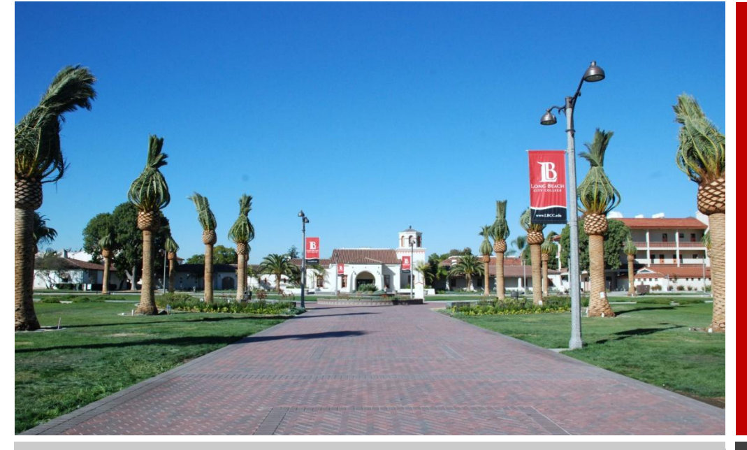
BUILDING A STUDENT SERVICES RETROFIT AT LAC