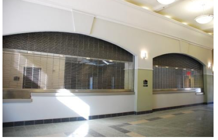
Admissions & Records, Financial Aid, and Counseling among other Student Services creates a "one-stop" shop for students.

Building A Student Services Retrofit at LAC