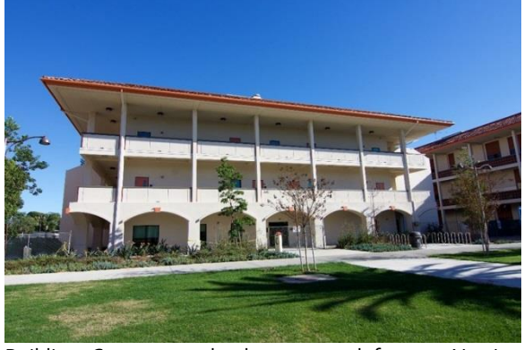
Building C was completely renovated for our Nursing Program. The 31,567 GSF building has 10 classrooms, 6 simulation labs, 12 Faculty offices and computer labs. Classes began in the state-of-the-art facility in Spring 2016.