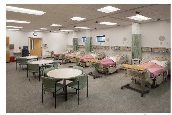
Simulation labs allow the students to get first-hand experience working with lifelike mannequin patients. Each bed is monitored with computers and closed circuit cameras during training.