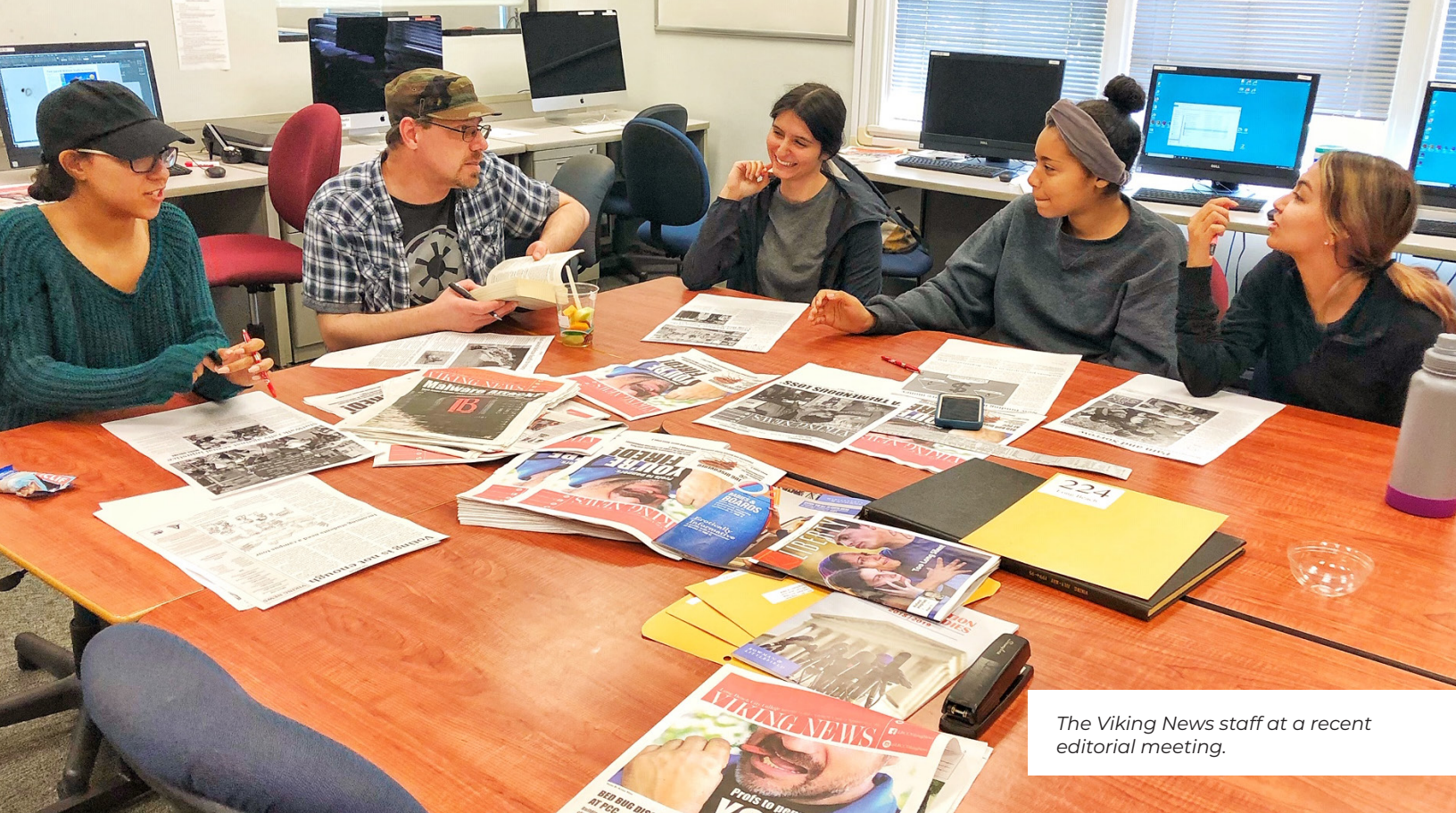
The Viking News staff at a recent editorial meeting.