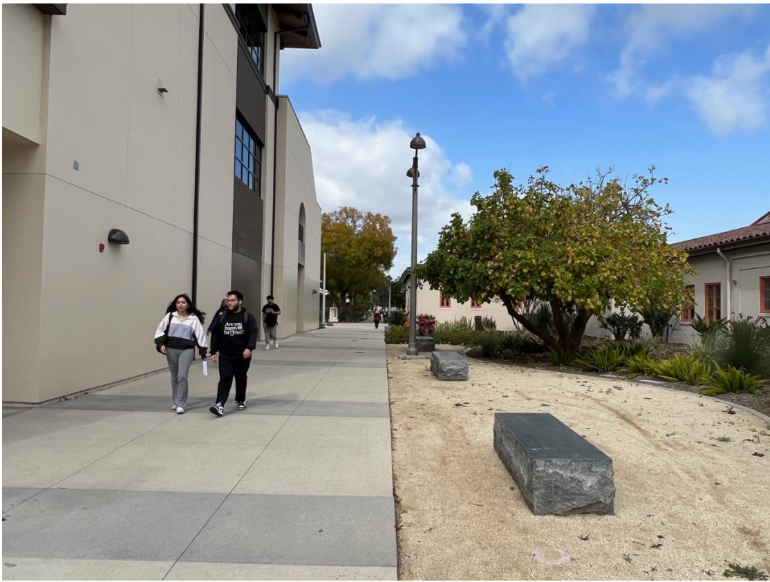
East side of the wall facing Clark Ave.