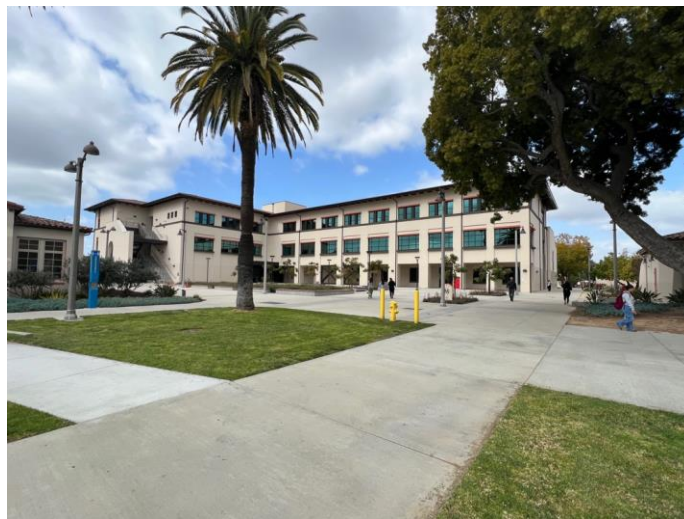
M Building from a distance, the proposal seeks to install a mural on the east facing wall.