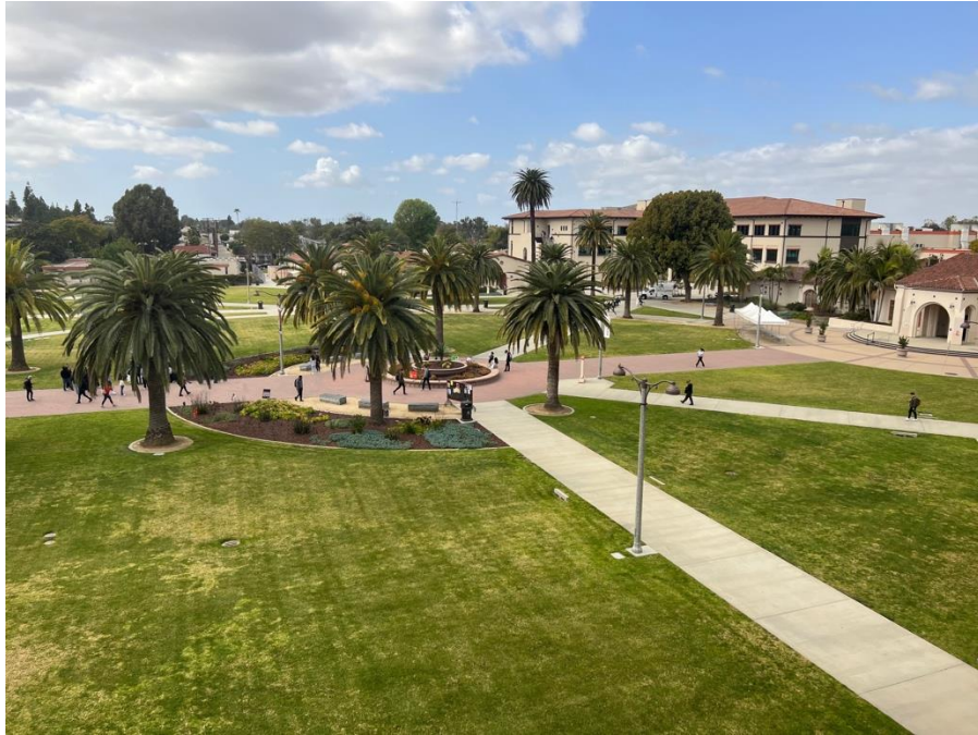
Liberal Arts Campus, with M Building in the back right corner

Elements: Direct exposure to all elements