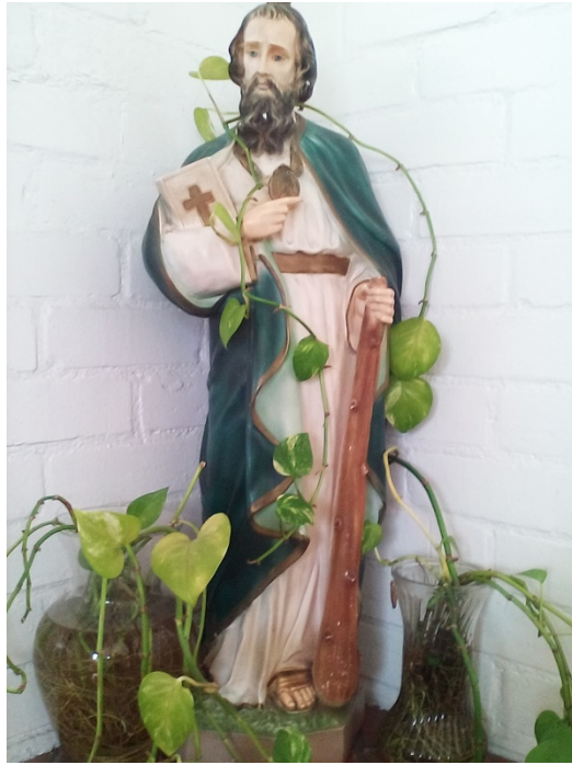
Statue of the Apostle Jude, Patron Saint of the Impossible and Lost Causes, in the south stairwell of St. Lucy's School, Long Beach, CA. (See footnote 17, page 10)