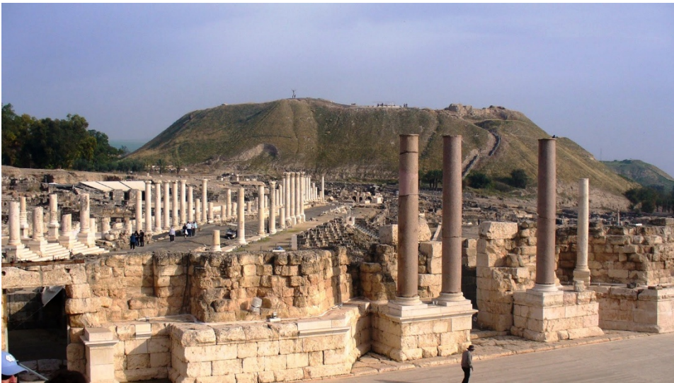
Above: Theatre and temple precinct at Beit She'an (Scythopolis), Israel, in the Galilee. These ruins of this cosmopolitan town serve as evidence that Galilee was not the backward place that the Jerusalem religious leaders believed it was.