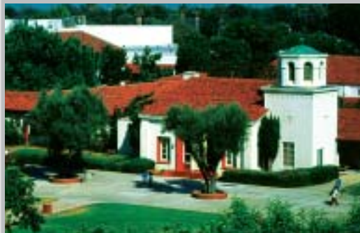
Liberal Arts Campus