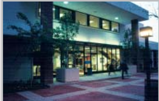
Pacific Coast Campus