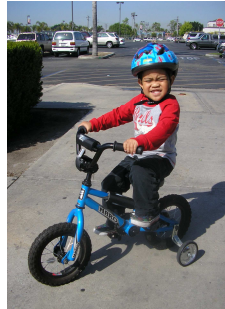
Bicycle Day on the Quad.