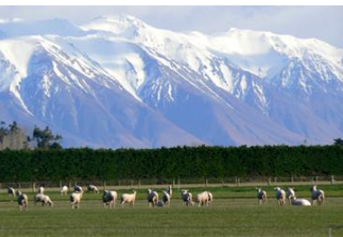
New Zealand's Southern Alps