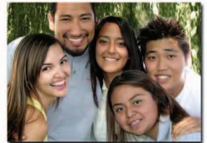
Student Ethnicity (Spring 2009)

LBCC offers 21 intercollegiate athletic programs for its student-athletes to choose from. The college holds more national and state titles and bowl appearances than any other California Community College and has twice been selected by Cal-Hi Sports as the best community college athletics program in the nation.