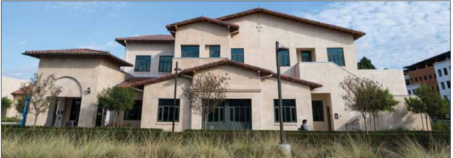
Building V at the Liberal Arts Campus is the new home for the Culinary Arts Department and the Math Department.

LBCC's $616-million modernization program continued to improve the student learning environment, thanks to taxpayer supported bonds in 2002 and 2008. In 2015, the construction highlights included: