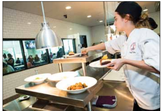
Building V includes seven instructional kitchens, and a restaurant and bakery corner run by LBCC students.