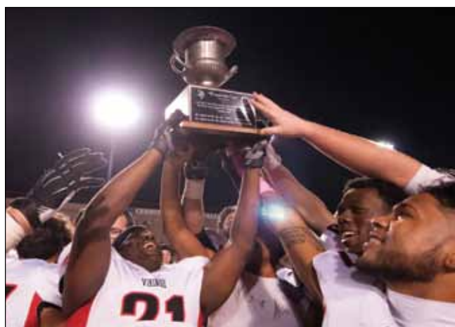
The LBCC Football team recaptured the Crosstown Cup thanks to its 34-30 win at Cerritos College in the Southern California Bowl.