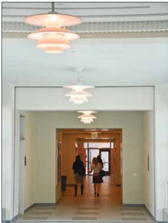
Renovations in Buildings AA and BB updated the classrooms while preserving the Art Deco style.

The College installed two new auto lifts, and carbon dioxide and methane detectors in Building JJ as part of the Advanced Transportation Technology program’s move to a new location.