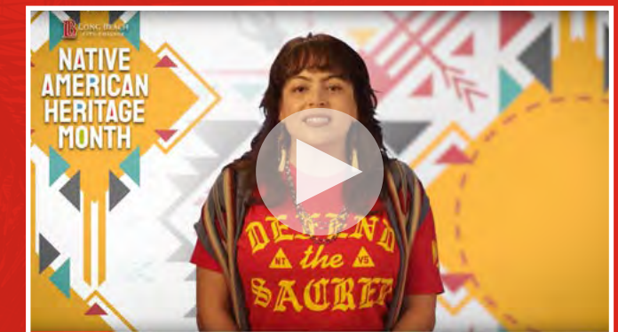
Native American Heritage Month