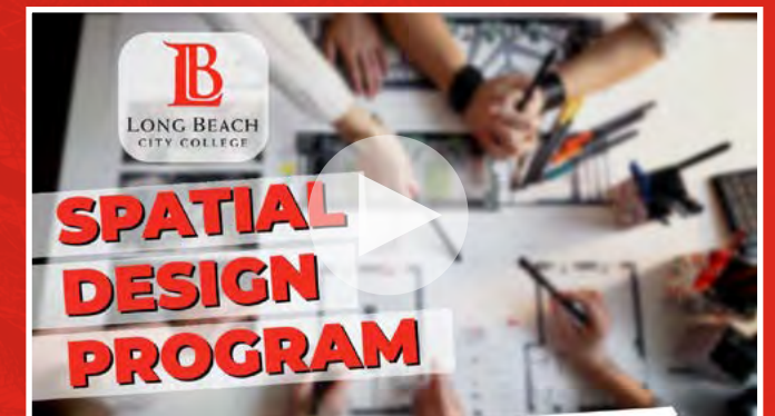
LBCC Career Education-Spatial Design