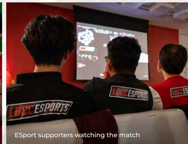
ESport supporters watching the match

Long Beach City College held our very first watch party for the new Esports team on Oct. 17. More than 70 people watched in-person in the Kinesiology Labs and Aquatic Center's multi-purpose room as the brand-new team beat the undefeated CSUDH's Toros. Hundreds of people also watched the action as it livestreamed on LBCC's Twitch channel. The new Esports program launched in September.