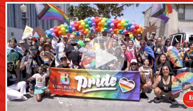
LGBTQ+ Inclusivity is Strong at LBCC