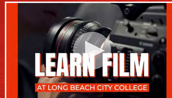
LBCC Career Education-Film