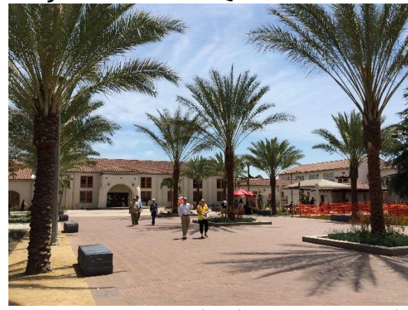
The Central Quad area is fully functional with beautiful landscaping, walkways, a pavilion, and areas for Faculty, Staff and Students to sit and enjoy their surroundings. The campus is in compliance with new regulations regarding storm water and the campus uses reclaimed water for all of the landscaping.

LAC Storm Water Compliance Project - Central Quad