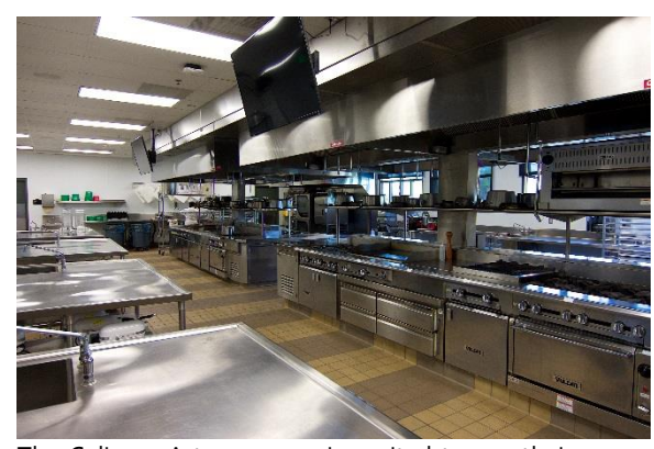
The Culinary Arts program is excited to use their 7 new kitchens including a Culinary Demonstration Kitchen where students can watch and learn from live demonstrations.