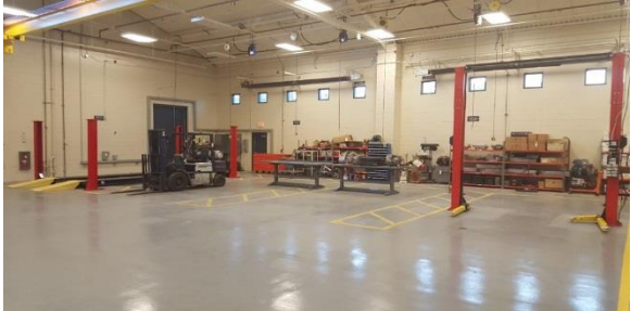
The majority of the Alternate Transportation Retrofit was completed in 2014 with additional retrofit work done this year. Two new auto lifts, Carbon Dioxide & Methane detectors were installed as part of the project.