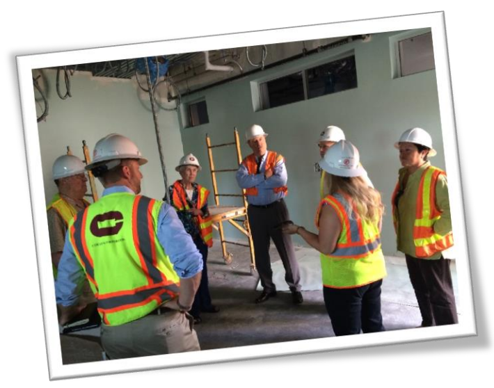
The Citizens' Oversight Committee toured the building during construction. Upgrades to the building addressed accessibility and seismic issues. The tours covered buildings on both campuses.

Both campuses have building projects near completion. LAC is putting the finishing touches on Building C for the Nursing Program and PCC will open Building GG, our Student Services Center, in 2016.