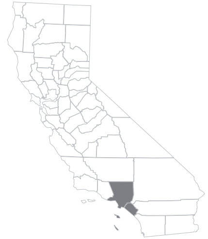
LOS ANGELES - ORANGE COUNTY MSA

L ONG Beach City College (LBCC) creates value in many ways. The college plays a key role in helping students increase their employability and achieve their individual potential. The college retains students in the Los Angeles - Orange County Metropolitan Statistical Area (MSA)* and provides students with the education, training, and skills they need to have fulfilling and prosperous careers. Furthermore, LBCC is a place for students to meet new people, increase their self-confidence, and promote their overall health and well-being.