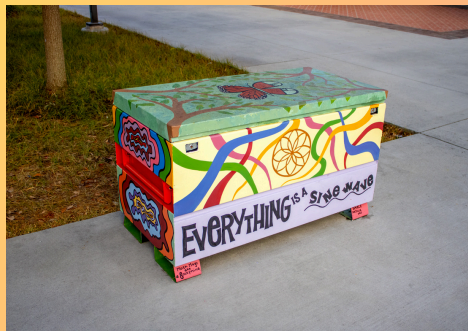
Building V - Math Success Center

Blending art, mathematics, and meaning, "Everything is a Sine Wave" illustrates the beauty of patterns found in nature and life, from the golden spiral of the monarch butterfly to the rhythmic waves that unite sound, light, and growth.