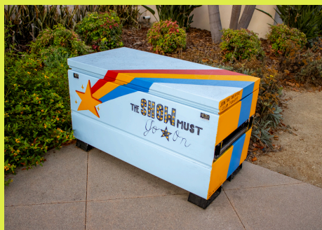
Building A - Spotlight Theatre Club

Our SAGE Scholars Academy Emergency Box will feature the Sankofa Bird which is our club logo and an Adinkra Symbol from the Twi language of Ghana. SAGE is the acronym for Sankofa Adjustments with Great Expectations.