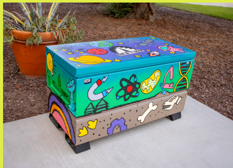
Building D - Science Resource Center

Blending art, mathematics, and meaning, "Everything is a Sine Wave" illustrates the beauty of patterns found in nature and life, from the golden spiral of the monarch butterfly to the rhythmic waves that unite sound, light, and growth.