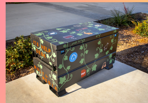
Building L - OLET

Shayla Perez, a former Theatre Arts student, created this design to serve as an inspiration for other students to join Spotlight Theatre Club.