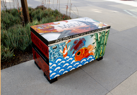
Building M - Mana